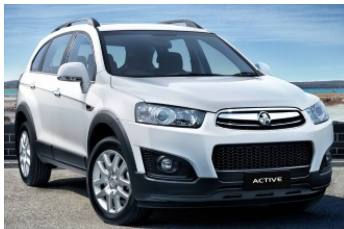
*Picture provided is a sample only